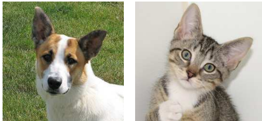
The orphans at Helping Paws Thank you!

Fox Valley Helping Paws Animal Welfare Association, a non-profit 501 (c) 3 organization, established a foster program in 1969 which rehomed orphaned animals into permanent, loving homes. Helping Paws incorporated as the first no-kill animal welfare association in McHenry County in 1971. The foster program outgrew its first facility and in 1995, Helping Paws moved to a new facility in Ridgefield. This facility, however, only had room to house cats. So, in 1998, Helping Paws again moved to a larger facility in Crystal Lake. The shelter's success in saving abandoned animals in McHenry County quickly outgrew the Crystal Lake facility, and in 2006, Helping Paws moved to a much larger facility with room for many more animals.